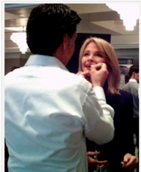
Lovely Diedre Hall always supportive of everyone's efforts.

In honor of the 2011 Grammy Awards, Carpet Events La and FusionExcel hosted the Redcarpet Gift Suite held at the London Hotel, in Hollywood on Friday Feb 11, 2011. The Redcarpet Gift Suite not only gave a wonderful assortment of gifts but collected donations for African Millennium Foundation (AMF) and Venice Arts .