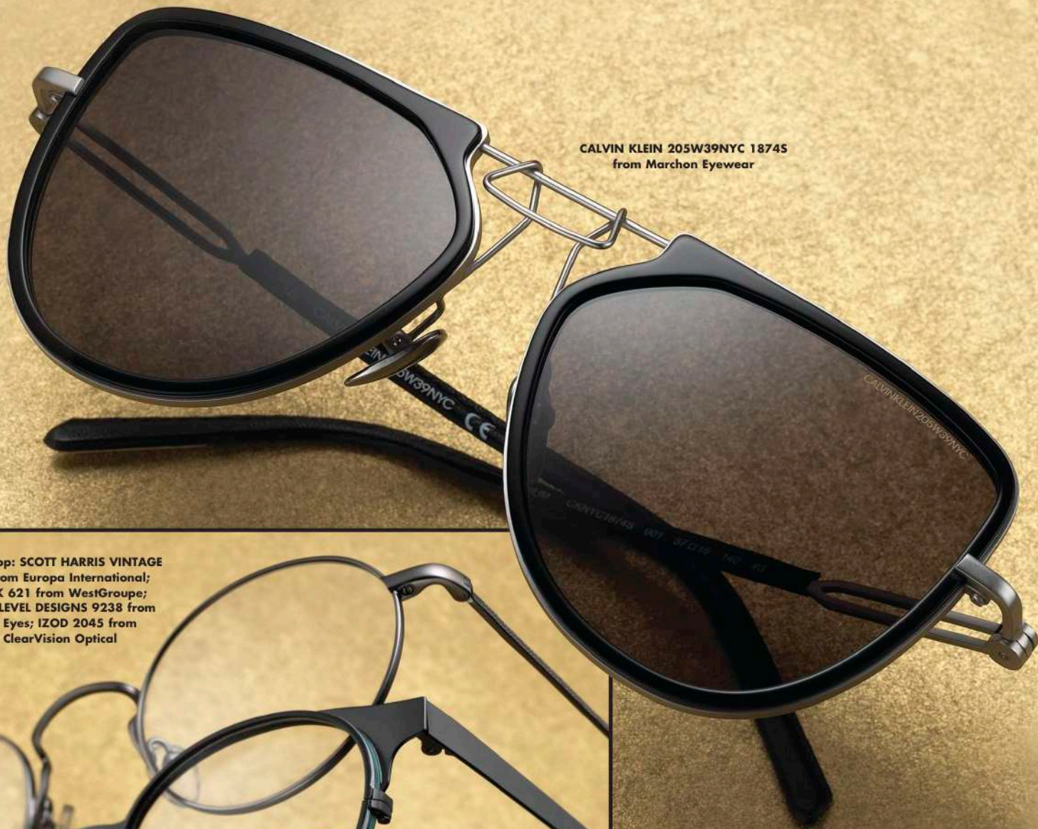
CALVIN KLEIN 205W39NYC 1874S from Marchon Eyewear