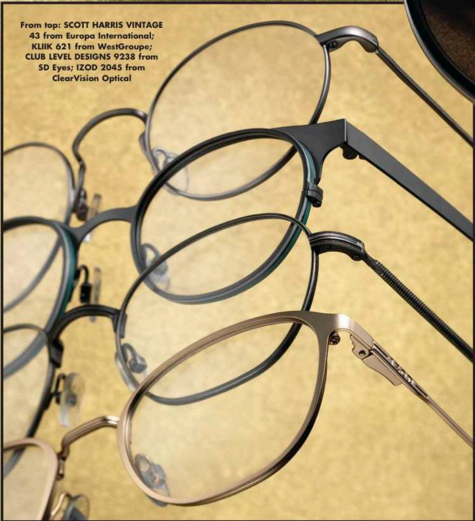
From top: SCOTT HARRIS VINTAGE 43 from Europa International; KLIK 621 from WestGroupe; CLUB LEVEL DESIGNS 9238 from SD Eyes; IZOD 2045 from ClearVision Optical