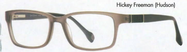
Hickey Freeman (Hudson)