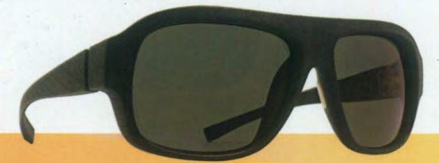
MYKITA MYLON (Titan)