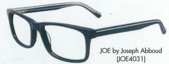
JOE by Joseph Abboud (JOE4031)