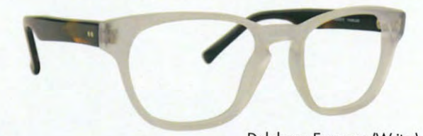
Dolabany Eyewear (Writer)