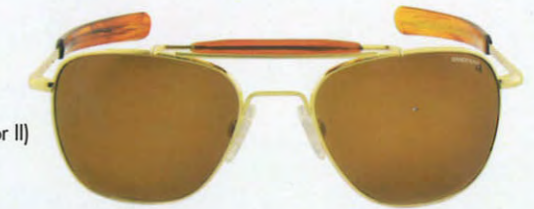
Randolph Engineering (Aviator II)