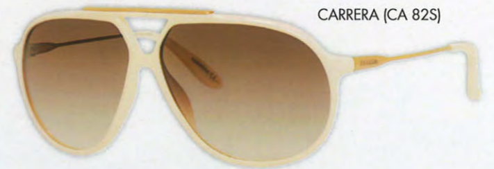
CARRERA (CA 82S)