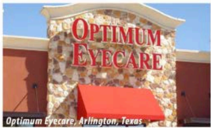
Optimum Eyecare, Arlington, Texas