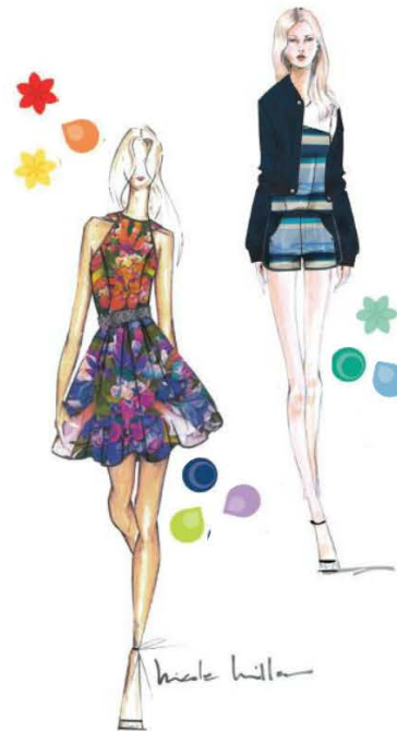
Above left, Nicole Miller perfectly blends bold color with bold pattern; above right, Charlotte Ronson mixes greens and blues

as monaco blue with emerald or African violet with poppy red. Also, mixing neutrals such as linen with dusk blue, or the palette's three greens is harmonious.