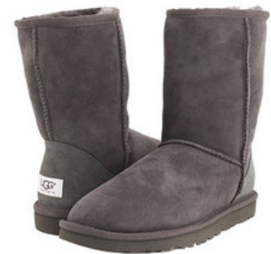
How to Know if Your Uggs Are Real