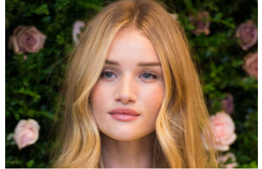
Do You Have Long Hair? This $69.99 Tool Will Change Your Life