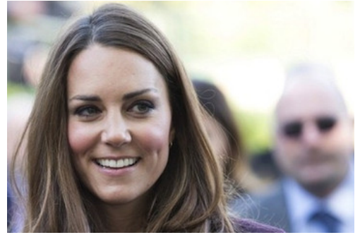
The EXACT Beauty Products Kate Middleton Uses