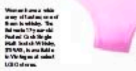
For more style list, including a make-up guide for the winter of 2014, visit the-star.com