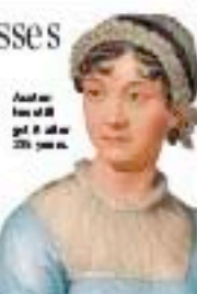
Austen was 41 when she died.

Firth is featured in the first Jane Austen film, Pride and Prejudice . Firth is featured in the first Jane Austen film, Pride and Prejudice . Firth is featured in the first Jane Austen film, Pride and Prejudice .