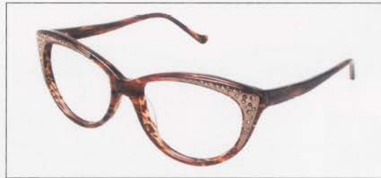
Vanni (distributed in the U.S. by Design Gallery) Vanni’s Hydra Collection Style No. V3653