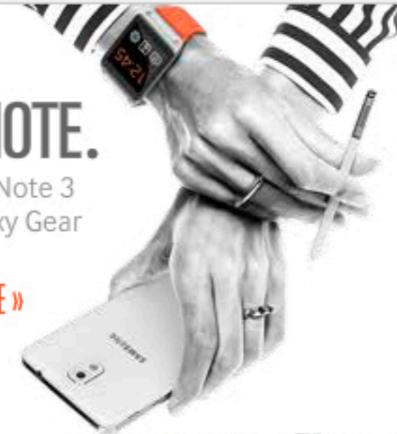
Samsung GALAXY Note 3 + Gear™