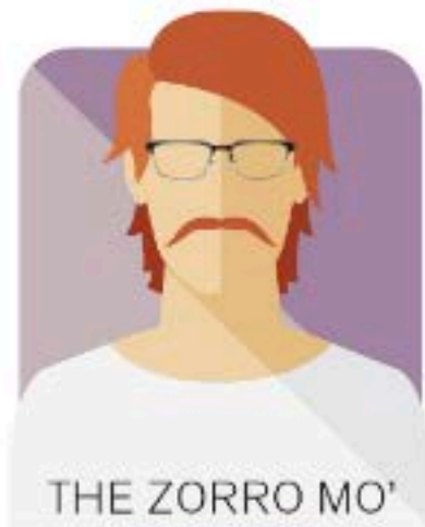
THE ZORRO MO'