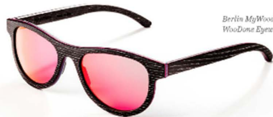
Berlin MyWoodi, WoodOne Eyewear