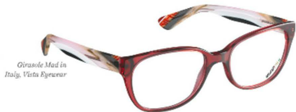
Girasole Mad in Italy, Vista Eyewear

RED IS THE COLOUR OF PASSION AND LOVE. IN THIS ISSUE WE SHARE SOME RED HOT LOOKS THAT DEMONSTRATE WHY WE ARE PASSIONATE ABOUT FASHIONABLE EYEWEAR.