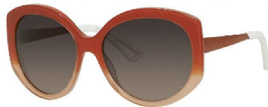
Dior Extase, Safilo