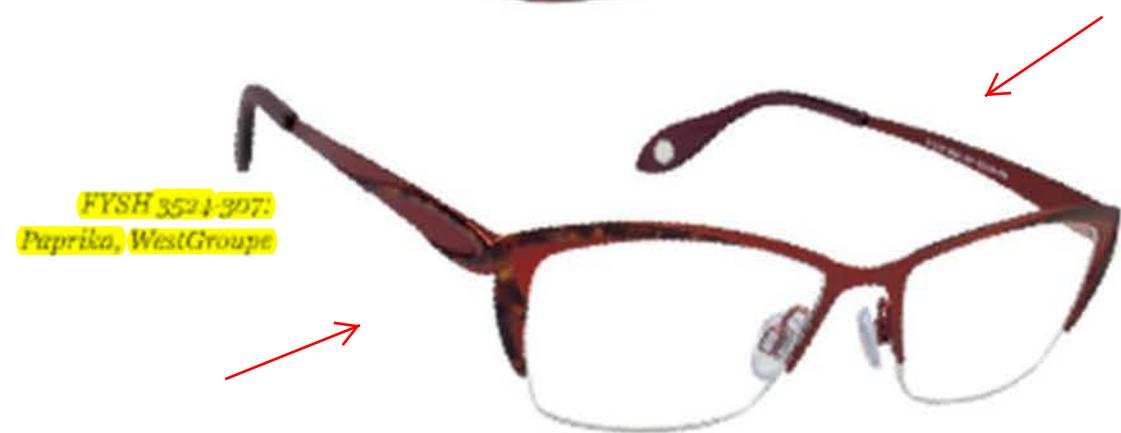
FYSH 3524-397 Paprika, WestGroup