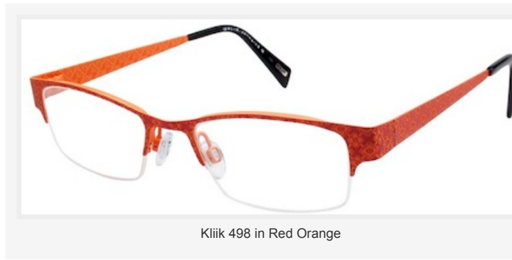
Klik 498 in Red Orange

Klik Style 498 comes in a few different colors. One attention grabbing pair is featured in color Red Orange. Orange may not be the easiest color to wear but this is to wear it right! I absolutely love the contrast of the black going over the ear hook in this bold pattern.