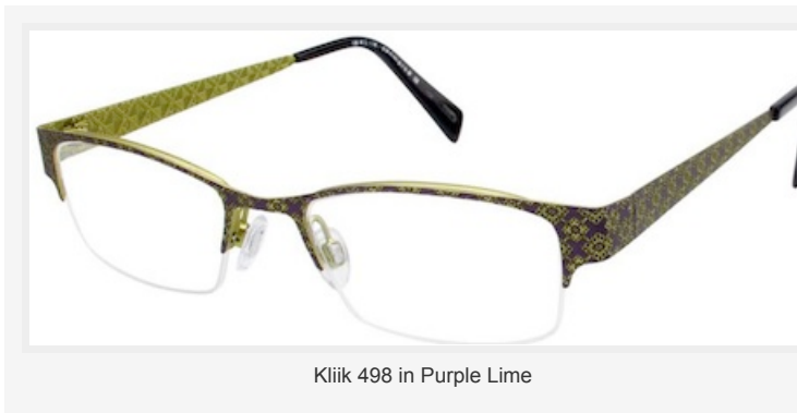
Kliik 498 in Purple Lime

I love a modern twist on a retro style and these Kliik frames in Purple Lime hold my heart. This shade of green and this pattern just scream 1970's to me! I could see Marsha Brady wearing these in 2014 while taking selfies on her iPhone in Copenhagen's Tivoli Gardens. #MarshaMarshaMarsha