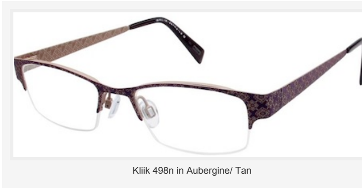
Kliik 498n in Aubergine/ Tan

There is something so captivating about the Kliik style 498 frames in Aubergine/Tan. From a distance it may look like a nicely shaped pair of rimless eyeglasses, but once you come up close there is a pleasant printed surprise. Think of it as painting by Claude Monet, but in reverse. Ja?!