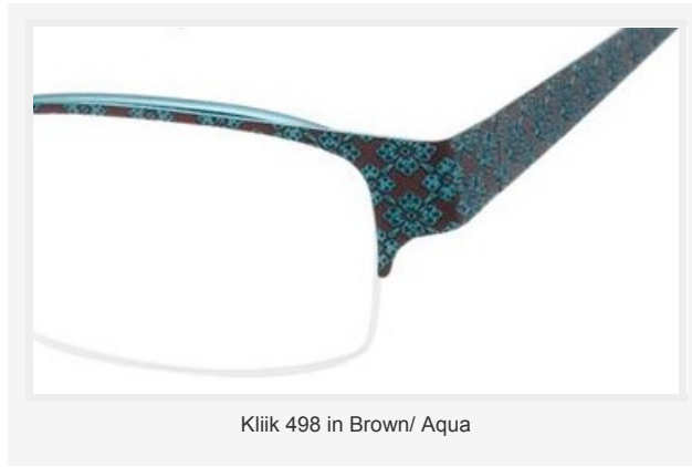
Kliik 498 in Brown/ Aqua

There is something so captivating about the Kliik style 498 frames in Aubergine/Tan. From a distance it may look like a nicely shaped pair of rimless eyeglasses, but once you come up close there is a pleasant printed surprise. Think of it as painting by Claude Monet, but in reverse. Ja?!